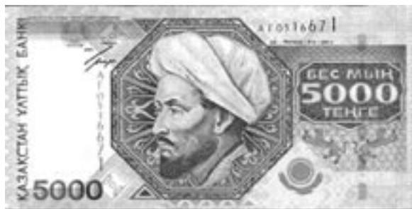
Farabi on Kazakhstan currency