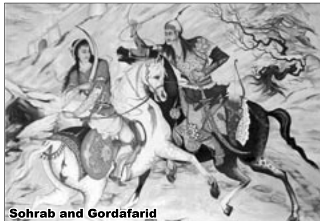
Sohrab and Gordafarid

The Scythians, and other early steppe Iranians are believed to have been the first Indo-Europeans to use domesticated horses for riding (as op-