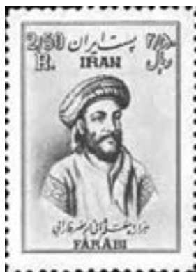
Farabi on Iranian stamp

There is increasing concern among Iranians that their cultural icons are being claimed by other nations in search of an identity. Persian-speaking poets, scientists and thinkers from days gone by are routinely claimed as national heroes by modern states like Uzbekistan and Kazakstan, on the basis of geography.